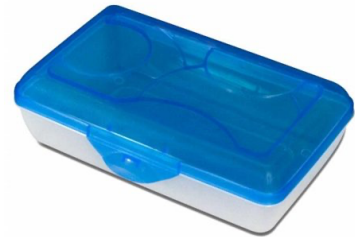
Example of a pencil box